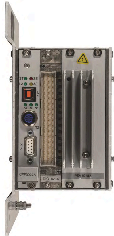
Vigilance Control System in flat rack with CAN interface module and extra logging memory