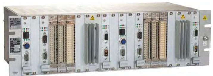
EKE-Trainnet® System including the Lateral Acceleration Monitoring System and Hot Axle Box Detection System