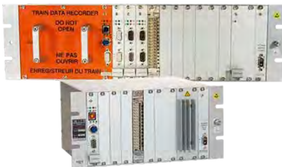
Train Control and Management Systems

EKE-Electronics offers a flexible TCMS development platform that supports both in-house and supported approaches. We can train your engineers to build and manage software applications independently or deliver a complete, ready-to-use solution. With powerful tools for custom application design and seamless third-party integration, you retain full control over your train control systems.